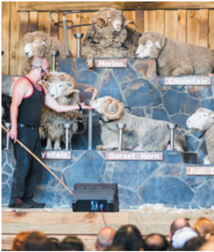
TOP TO BOTTOM: Enjoy spectacular views from the Skyline Rotorua; Agrodome, an educational hands on experience.