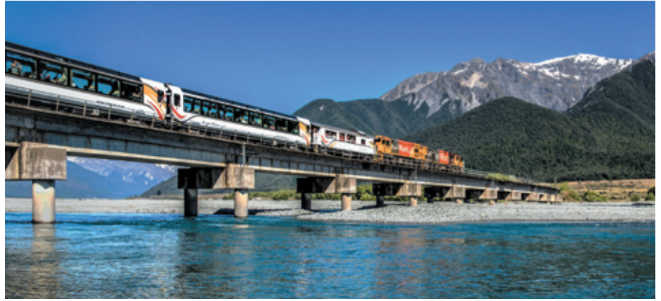
CLOCKWISE FROM TOP LEFT: Visit the Hole in the Rock in the Bay of Islands; the world-renowned TransAlpine rail journey; the Milford Sound Cruise continues to be the highest rated South Island attraction by our travellers; panoramic windows allow you to view the spectacular scenery.